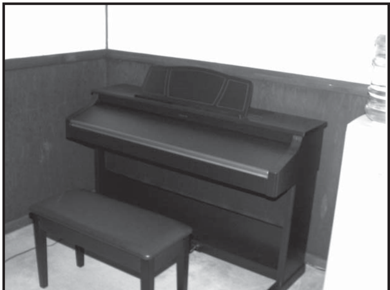
The choir practices before each Sunday Morning Service in the choir practice room. The new piano has already been a tremendous blessing in the choir's preparation for worship.